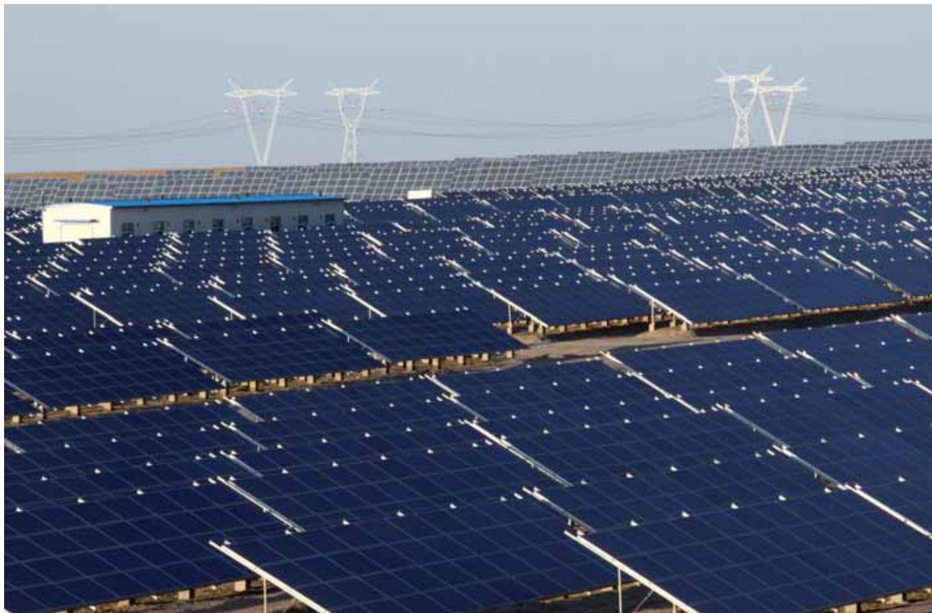
Ancona - Italy