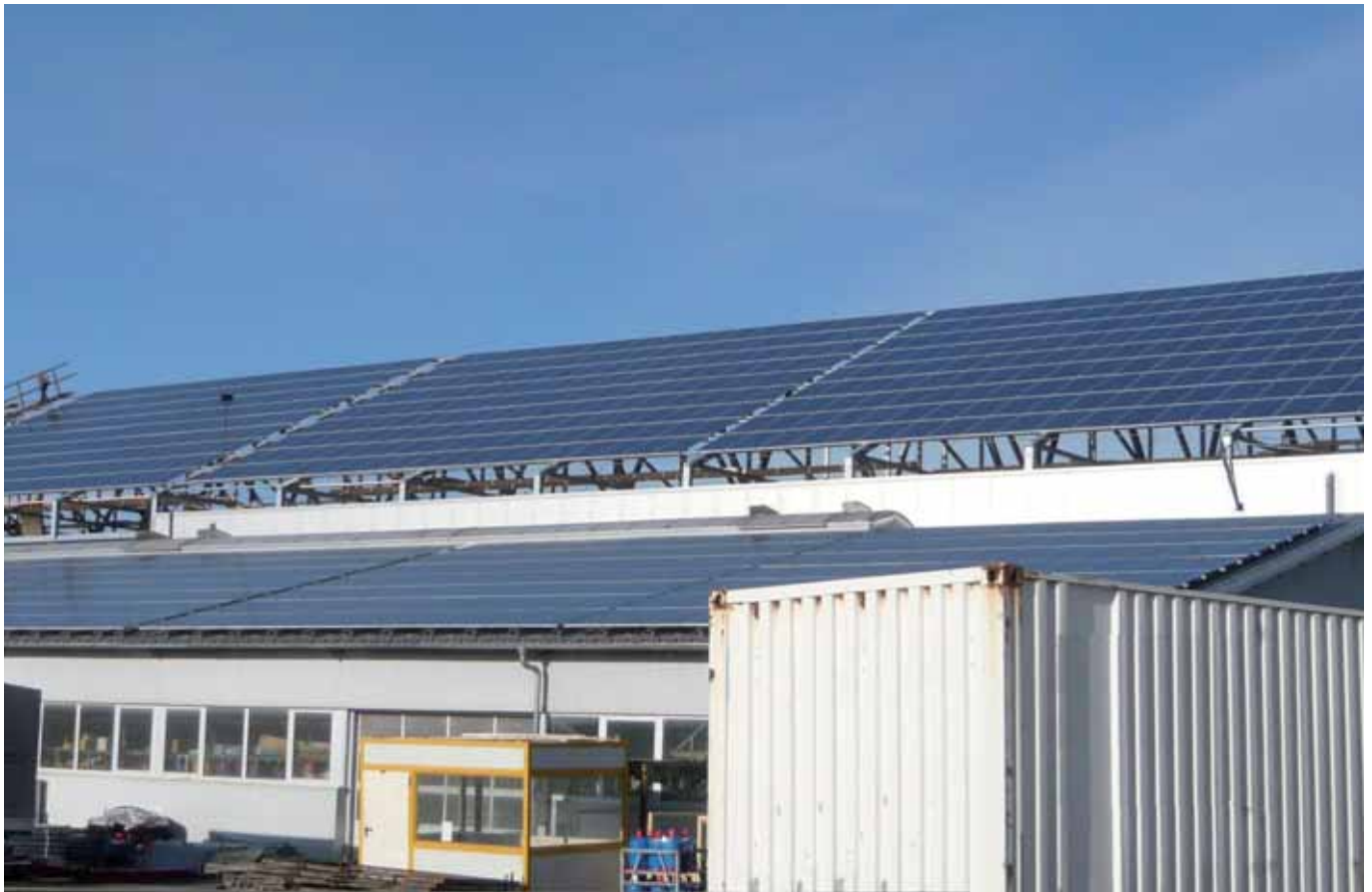
Bologna - Italy